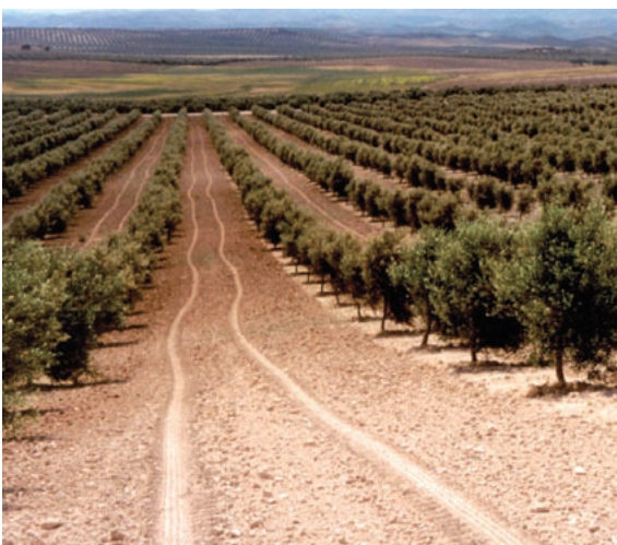
An example of spatial variability of soil organic carbon content

Roots are a great contributor to soil organic matter. Grassland produces deep roots that decay deep in the soil. Forest soils in contrast rely primarily on the decay of surface litter for organic matter input. Crops produce more above-ground biomass than roots. The organic matter input on cropland depends on the land management practices, including whether crop residues are removed or left behind.