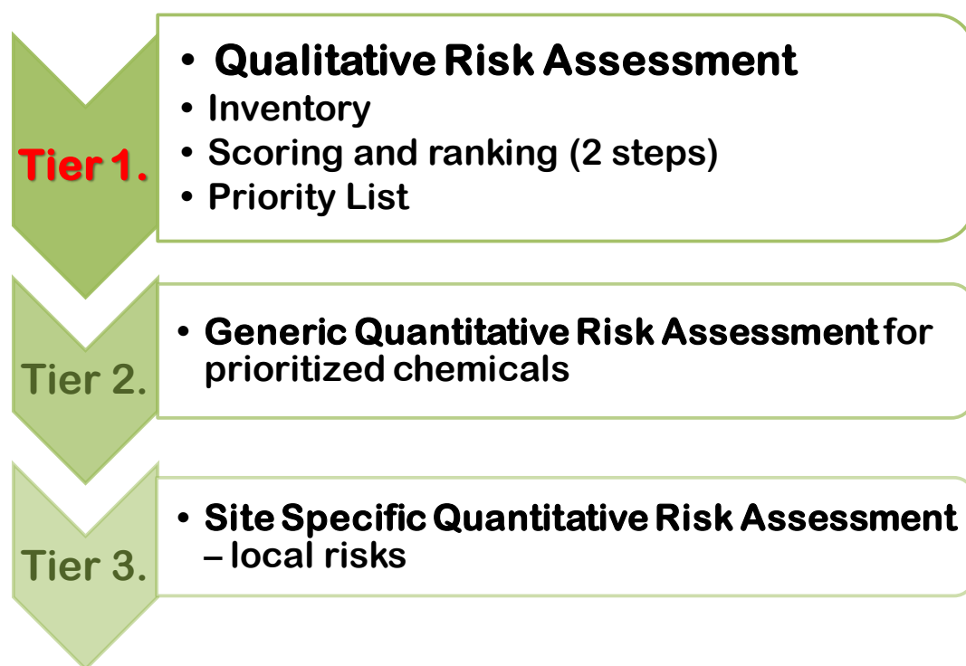
Figure 2. CDFILTER - tiered risk assessment methodology for micropollutants in water

The last tier was the site specific risk assessment which gave a more detailed picture on the local risks. In the case of Site specific Risk Assessment the PEC/PNEC approach was also applied too, but instead of default values the site specific measured concentrations and site specific environmental parameters were used. Local risk quotient was calculated for the river Danube and treated wastewater discharging surface water bodies in the case of selected micropollutants (Figure 2).