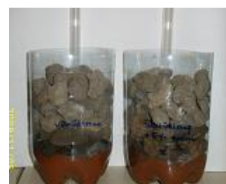
Figure 2: Red mud + concrete (20–30 mm fraction) in PET bottles

In case of 17 mm precipitation (average large rain event) 80–90 mm (concrete) and 90–100 mm (brick) fringe height was measured, which means that both materials can suck up 4.7–5.9 times the original height of the water. Therefore in case of a heavy rain event or flood, there is a need for an appropriately designed capillary block layer, which is able to block the upward filtration of water so that it should not reach the capillary layer.