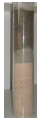
Figure 5: Water infiltration into the top (grey soil) layer (25 cm) after 5 days. Bottom layer: 25 cm brick.

At larger scale we followed the infiltration (11 mm model precipitation per day) for 8 days into: 1. 25 cm top layer (grey soil) and 25 cm capillary layer (brick) (Figure 5); 2. 50 cm top layer and 50 cm capillary layer. In the first experiment the water front reached the bottom of the top layer by day 7. In the second experiment the water front reached 36.2 cm from the top by day 8. This validated that for the top layer 50 cm should be enough under the modelled weather conditions.