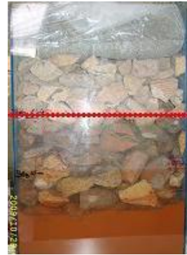
Figure 4: Water suction from red mud + 45 mm precipitation by coarse brick (30–50 mm) after 1 week