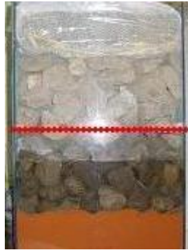
Figure 3: Water suction from red mud + 45 mm precipitation by coarse concrete (30–50 mm) after 1 week

We can conclude that the 30–50 mm fraction of crushed concrete is recommended for capillary block layer, with the minimum height of 150 mm, as it has low water suction potential. The 30–50 mm fraction of crushed brick could also be used with the minimum height of 250 mm.